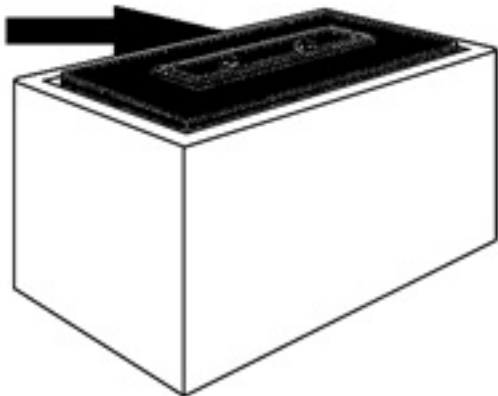
FT-323A (35 lbs) 24"L x 12"W x 2"H